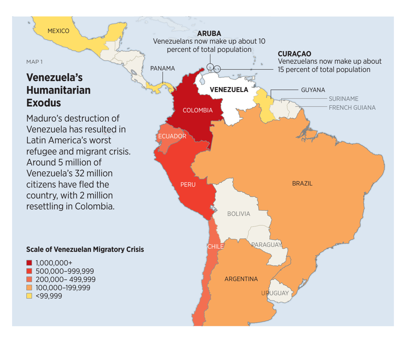
SOURCES: Organization of American States, "Preliminary Report on the Venezuelan Migrant and Refugee Crisis in the Region," March 8, 2019, http://www.oas.org/documents/eng/press/Preliminary-Report-2019-on-Venezuelan-Migrant-and-Refugee-Crisis-in-the-Region.pdf (accessed May 15, 2019); Migration Policy Institute, "Creativity amid Crisis: Legal Pathways for Venezuelan Migrants in Latin America," January, 2019, https://www.migrationpolicy.org/research/legal-pathways-venezuelan-migrants-latin-america (accessed May 15, 2019); and author's field research in Colombia.